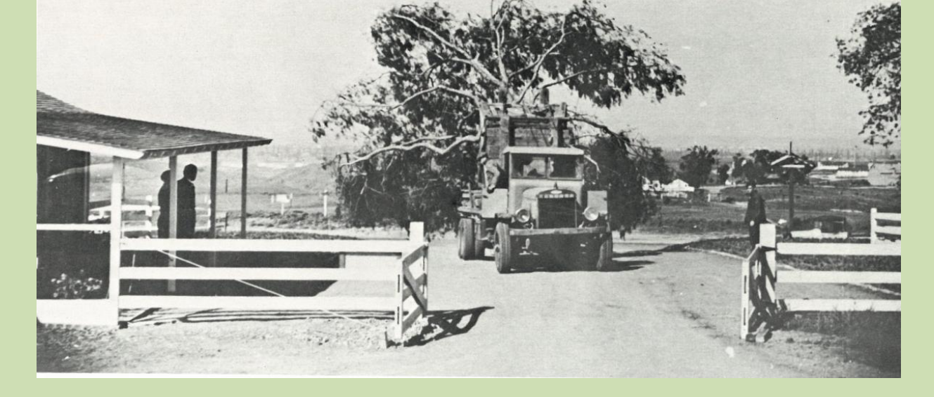
Here is a photo of the first big tree being moved into the city.

Not many trees this large were moved in those days. It is going through the Rolling Hills gate - a salesman for the Palos Verdes Corporation is watching intently... Forty years [85 years] ago we did not have the mechanical gates we have today. The left-hand gate was opened and closed by a series of pulleys and window-sash cords.